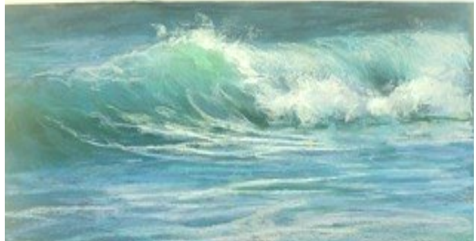
Pastel Sketch by Leoni Duff